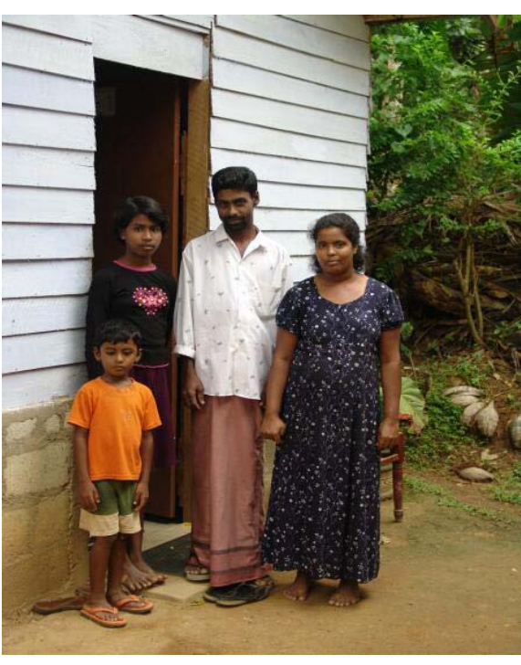
BENEFICIARY APPROVED BY PIPA FOR PHASE II CONSTRUCTION